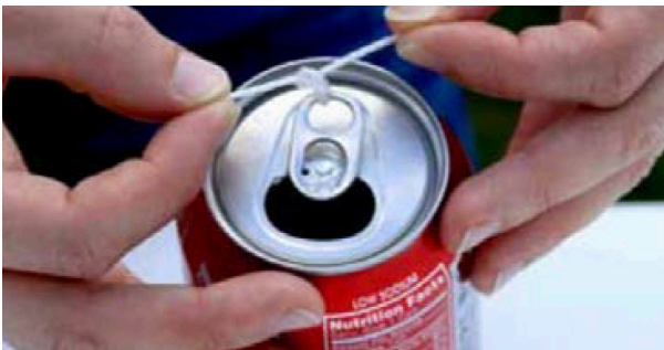
Figure 1: Tie the string to the tab on the can.