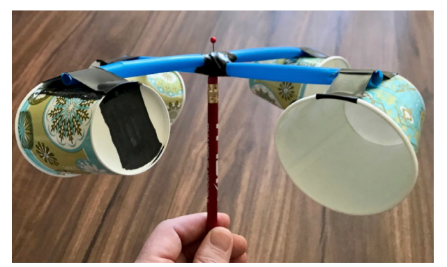
Figure 3: Attach the cups to the straws using a stapler.

5. Place your anemometer into a steady source of wind, such as a fan, an air vent or the wind outside. Count the number of revolutions the anemometer makes in one minute by counting how many times the marked cup passes. See Figure 4 .