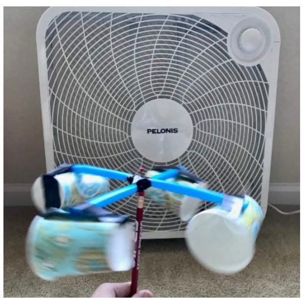
Figure 4: Figure 4: Place the anemometer in a stream of air to see it rotate.

5. Place your anemometer into a steady source of wind, such as a fan, an air vent or the wind outside. Count the number of revolutions the anemometer makes in one minute by counting how many times the marked cup passes. See Figure 4 .