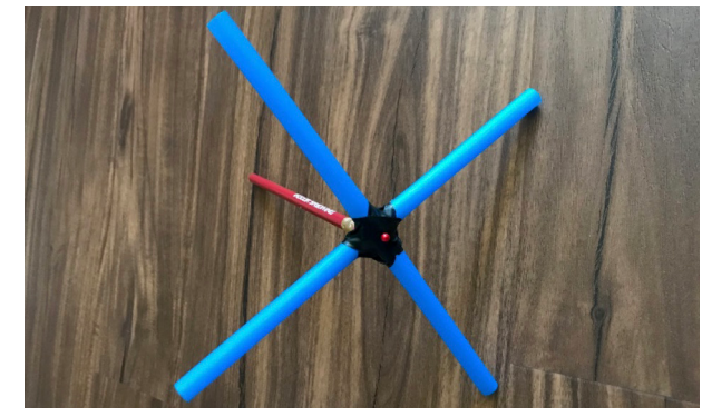
Figure 2: Attach the straws to the pencil with a pin.

the straws. This will allow the anemometer to spin more freely in the wind. You can also make the hole larger by moving the pin in and out several times.