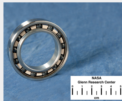
FIGURE 2: NiTi alloy ball bearing provides for shock tolerant, corrosion immune operational capability for the most demanding bearing applications.