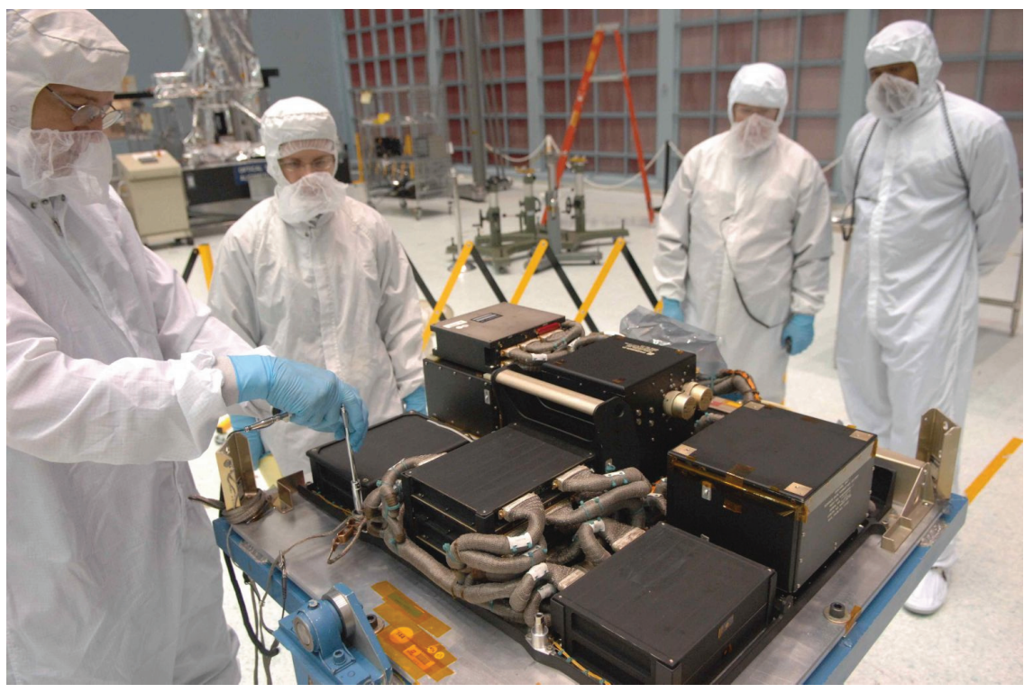
Technicians prepare the replacement SI C&DH for testing in a large clean room at the Goddard Space Flight Center.