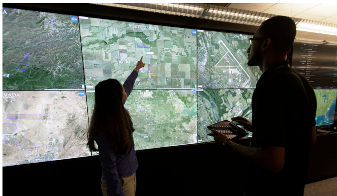
In early 2016, NASA and operators from the Federal Aviation Administration's six drone test sites across the country flew multiple drones simultaneously to test rural operations of NASA's traffic management research platform.

While negotiating additional arrangements, NASA already has a large number of partner agreements on UTM research in place. To view this list go to: www.nasa.gov/aeroresearch/programs/aosp/saso/partners .