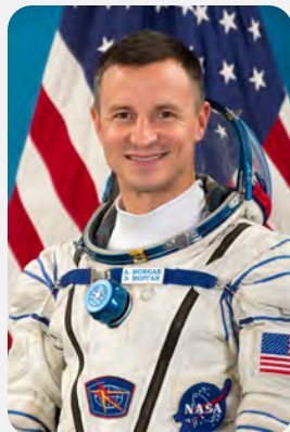
Andrew Morgan NASA