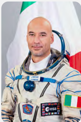
Luca Parmitano (prime)