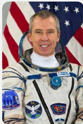
Drew Feustel NASA