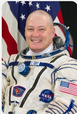
Scott Tingle NASA