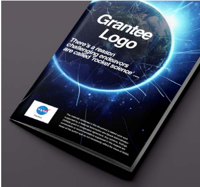
Figure 3: Brochure (with disclaimer)