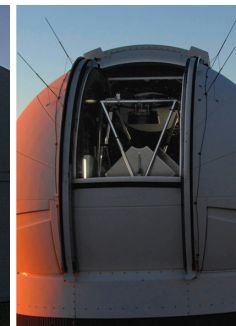
NASA's Infrared Telescope Facility (IRTF)