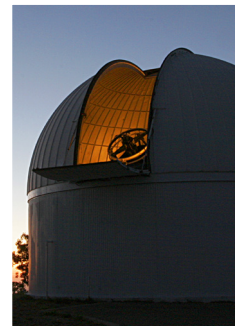
Pan-STARRS University of Hawaii