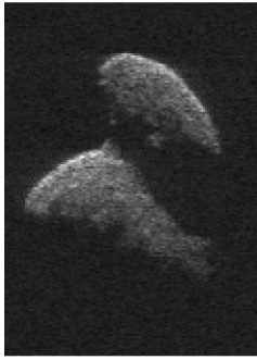
Radar Image of 2012 JO25