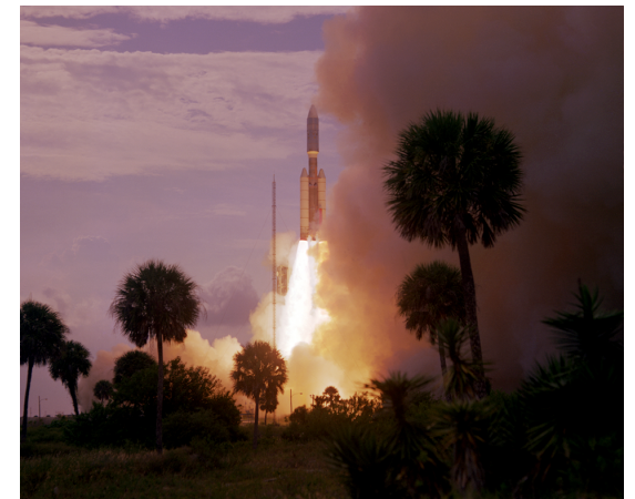
Aug. 20, 1975 – Launch of Viking 1.