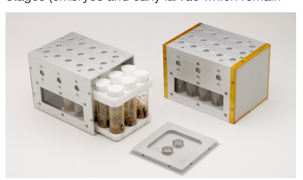
Each Vented Fly Box accommodates 15 vials containing fly cultures and food.

The second fruit fly hardware platform, the Fly Cassette system, supports multigenerational studies of fruit flies in microgravity. This system has two major components: the Fly Cassette and the Food Changeout Platform. Fly Cassettes are enclosed fly habitats within which food trays can be inserted and removed by astronaut crew using Food Changeout platforms. Since fresh food is introduced periodically to each cassette, use of this system requires more crew time than the VFB, but can support multigenerational and longer duration studies than the other hardware options. Each changeout operation allows separation of flies at different developmental stages (embryos and early larvae which remain