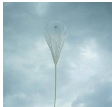
The stratollite high-altitude balloon flight platform from World View Enterprises.

Visit the World View website to learn more about platforms to consider for testing your payload.