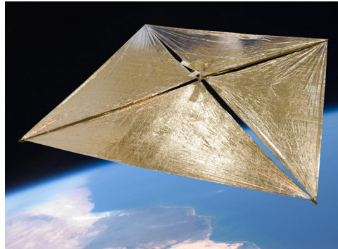
NanoSail-D (on orbit deployed configuration)