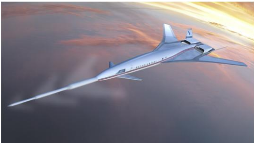
Future civil supersonic airliner

The most important factor in the process of creating a supersonic airliner is the design of it. When engineers design a subsonic aircraft they do take into consideration only factors like aerodynamic, fuel efficiency, high lift to drag ratio and more space for the passengers. Unfortunately, this does not happen in supersonic aircrafts. Engineers try to design a supersonic airliner, which will produce a low sonic boom, will be able to overcome the wave drag and carry as many passengers as possible.