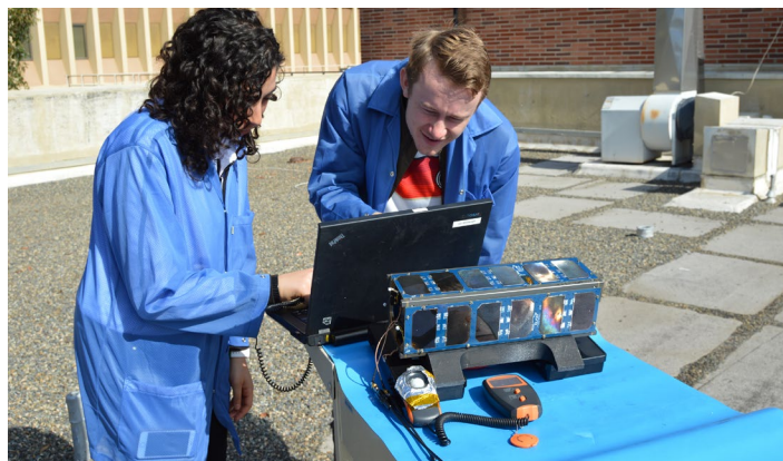
University of California, Los Angeles (UCLA) students conducting a solar cell test.

ELFIN is a space weather CubeSat that will investigate the loss of relativistic particles from the Van Allen radiation belts radiation belts into the Earth's atmosphere. It will determine the precipitation rates and pitch-angle scattering properties of the equatorial wave-particle interactions, a fundamental plasma-physics question related to radiation belt dynamics. ELFIN uses two identical 3U CubeSats to measure how the precipitated electrons vary across space and time.