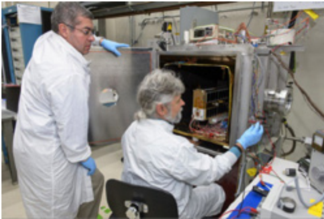
EcAMSat undergoes thermal vacuum power management (TVPM) testing at NASA Ames. The test simulates the thermal vacuum and power environment of space and is an element of the spacecraft's flight validation testing program.

agent, only buffer solution. After 48 hours a fluid exchange occurs and alamarBlue®, a dye used to determine viability of the bacteria by measuring its metabolism, is then introduced to all wells and viability is tracked for at least 48 hours. An optical system tracks viability by color change of the 'viability dye', which changes from blue to pink when enzymes generated by cellular metabolic processes act upon it. EcAMSat acquires data from optical measurements in realtime. It is capable of autonomous operation and stores 152 hours of data. Overall, the experiment will determine the lowest concentration of antibiotic that inhibits bacterial growth. The knowledge gained in this experiment may be useful for prescribing the correct dose of antibiotics for future space travelers.