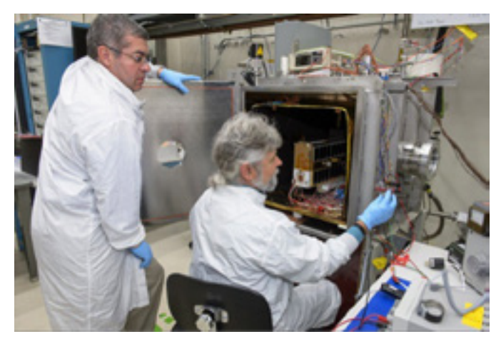
EcAMSat undergoes thermal vacuum power management (TVPM) testing at NASA Ames. The test simulates the thermal vacuum and power environment of space and is an element of the spacecraft's flight validation testing program.

agent, only buffer solution. After 48 hours a fluid exchange occurs and alamarBlue<sup>®</sup>, a dye used to determine viability of the bacteria by measuring its metabolism, is then introduced to all wells and viability is tracked for at least 48 hours. An optical system tracks viability by color change of the 'viability dye', which changes from blue to pink when enzymes generated by cellular metabolic processes act upon it. EcAMSat acquires data from optical measurements in realtime. It is capable of autonomous operation and stores 152 hours of data. Overall, the experiment will determine the lowest concentration of antibiotic that inhibits bacterial growth. The knowledge gained in this experiment may be useful for prescribing the correct dose of antibiotics for future space travelers.