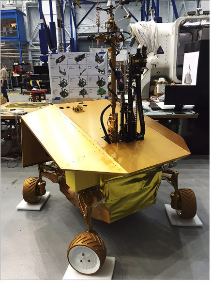
Resource Prospector prototype assembly.

National Aeronautics and Space Administration