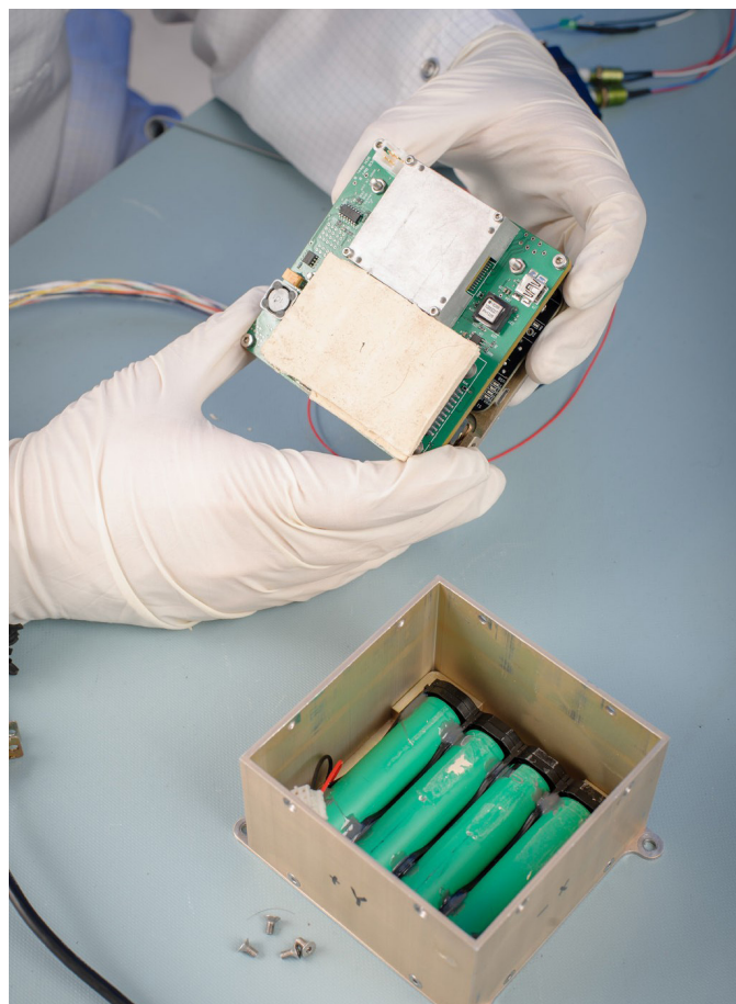
AVA controller is smaller than a stack of 6 compact disc cases, and weighs in at under a kilogram—batteries included!

The GCD Program investigates ideas and approaches that could solve significant technological problems and