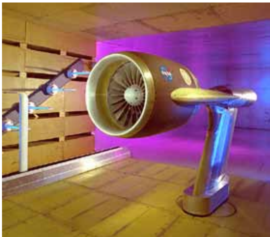
From left to right: Ultra High Bypass (UHB) ducted fan test, Allison low-speed noise fan, Open Rotor (unducted) fan testing, and laser imaging of exhaust from the supersonic STOVL hot gas ingestion model.

Programs supported in the facility have included a wide variety of state-of-the-art commercial aircraft propulsion systems, the Advanced Tactical Fighter, the Joint Strike Fighter, and other military STOVL aircraft applications.