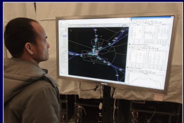
Analysis of FIAT simulation data