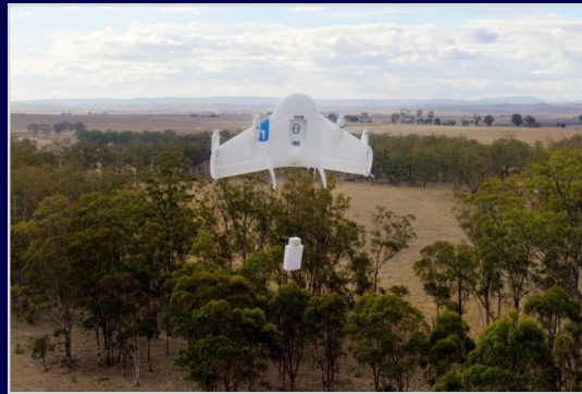
An experimental Google delivery drone in Queensland, Australia. Legal, social and financial hurdles for drone use remain.