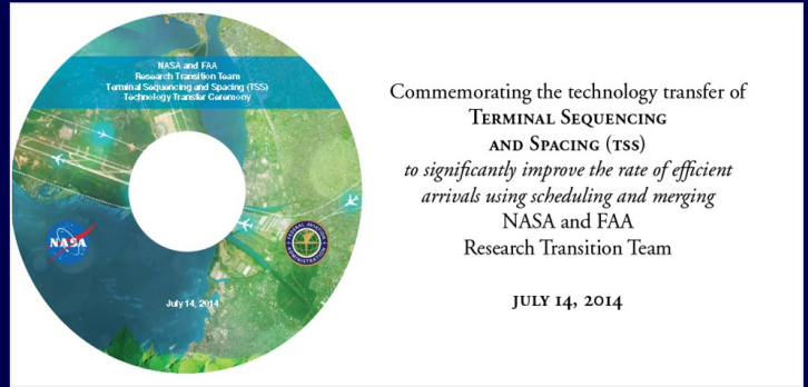
A picture of the CD used to represent the technology transition from NASA to the FAA