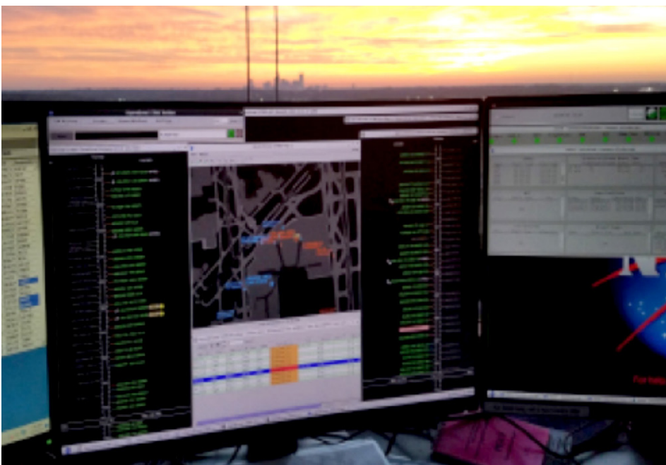
Display depicting ATD-2 Phase 1B Operations.

Phase 1B operations began November 1. In this micro-phase, FAA Traffic Management Coordinators (TMCs) at the CLT ATCT and Washington ARTCC used the ATD-2 system to electronically negotiate takeoff times for Call for Release (also known as Approval Request or APREQ) departures being scheduled into busy northeast corridor overhead traffic flows. The ATD-2 electronic negotiation feature builds on the Integrated Departure Arrival Capability (IDAC) in the FAA’s Time Based Flow Management (TBFM) system. In the ATD-2 implementation, the standard IDAC tower user interface is replaced by the ATD-2 IADS Surface Trajectory Based Operations (STBO) component, enabling ATCT TMCs to perform IDAC-style scheduling for APREQ flights with their primary surface tool. Additionally, the ATD-2 implementation automatically delivers predicted takeoff times from the STBO surface tool to the Washington ARTCC tool, thereby improving CLT departure demand predictions used by the TBFM scheduling system. The ATD-2 IADS system also includes user interfaces at the CLT ramp tower that provide ramp managers and controllers