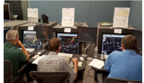
Summer Matter Experts Participating in DRAW Experiment.

The Airspace Technology Demonstration 3 sub-project completed the second human-