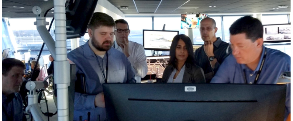
ATD-2 Tools in Live Operations at CLT.

The goal of this was to demonstrate sufficient APREQ compliance performance for the ATD-2 system to be operated in fully-automatic mode for APREQ scheduling. Phase 1B concluded in late November.