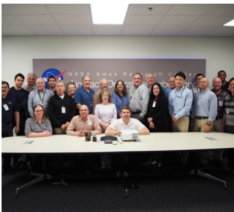
The CDM Flow Evaluation Team joined IDM researchers and subject matter experts for a 2-day exploratory human-in-the-loop simulation in the Ames Airspace Operations Laboratory.

Assigned equipage levels varied between runs which gave operators a chance to see how benefits were distributed system-wide, as well as the differential impact between “early” and “late adopters.” A longer “full-simulation” that looked at the broader impact of IDM during convective weather on multi-airport operations was run on the second day. Participants found the mixed-equipage scenarios particularly enlightening and were pleasantly surprised to see how the benefits (reduced ground delay, improved schedule conformance, and improved throughput) were shared across all users.