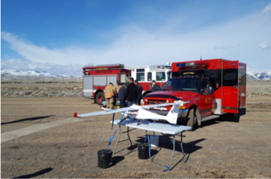
UTM Technical Capability Level 3 testing at the Reno-Stead Airport UAS test range in Nevada.