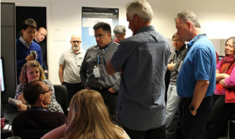
Members of the TFMS DT team met with NASA researchers for IDM HITL simulations.

current beta-test of the mobile application. Pilots provided feedback that NASA can use to understand GA operations and their departure procedures at CLT. Specific data elements that may be available to pilots were also discussed. Pilots provided additional feedback on the potential usefulness of receiving each of the data elements.