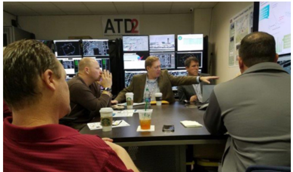
ATD-2 demo and briefing to NATCA leadership at CLT.

began with a briefing, demonstration, and a question-and-answer session at NASA's lab at the Charlotte Douglas International Airport (CLT). The visitors then went to the FAA Air Traffic Control Tower and Terminal Radar Approach Control facility to observe the ATD-2 Integrated Arrival/Departure/Surface Operations system in use there. The familiarization visit wrapped up with observations in the American Airlines Ramp Tower at CLT. NATCA has been a partner from the beginning of the ATD-2 Field Demo effort, providing invaluable expertise and support. During this visit, NATCA's leadership expressed interest in the early results from the field demo, a desire to expand its use in other locations, and continued support for the collaborative effort.