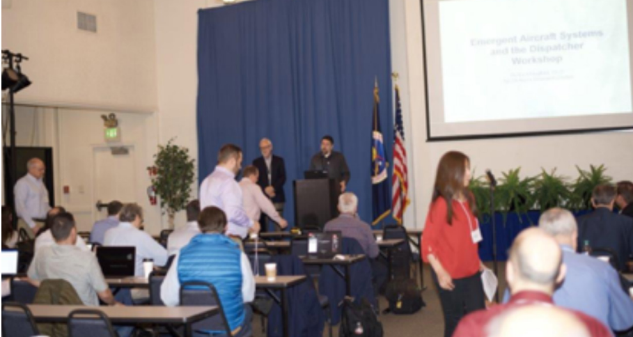
Attendees at the Emergent Aircraft Systems and the Dispatcher Workshop.

of cargo, urban air mobility, package delivery, infrastructure surveillance, agricultural survey, environmental monitoring, and other areas. However, the infrastructure and technology to enable and safely manage widespread use of these aircraft does not yet exist. The various classes of new vehicles will need adaptations of traditional air traffic management to ensure safe separation from each other and from other aircraft. These aircraft will also require services that have been traditionally provided by AOCs to manage commercial aircraft fleets. This includes flight planning, flight following, weather avoidance, equipment monitoring, maintenance, weight and balance, and crew scheduling. The workshop focused on how AOC services (or fleet management) could be applied to future manned and unmanned flight operations and on NASA's