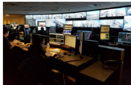
American Airlines Command Center.

On January 30, the American Airlines (AAL) Dallas-Fort Worth (DFW) Control Center Manager hosted a tour of the airline's new Command Center facility, located in Terminal A of DFW, for NASA's North Texas Research Station (NTX) personnel. This 10,000 square foot windowless facility replaced the 1,500 square foot ramp tower positioned between Terminals A and C, and it serves as a model for future airport control centers