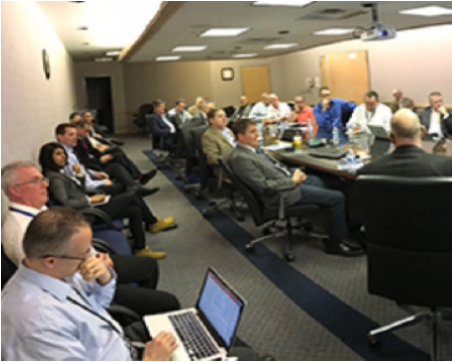
North Texas Field Demo Partners Meeting.

Demo Partners discussed better use of existing capacity at the terminal departure boundary as a key expected benefit of the technology. Participants expressed concurrence with the near-term objectives, the agile development plan, and next steps. The NASA team will meet regularly with North Texas Field Demo Partners to refine the IADS terminal departure scheduling concept and technology via the agile requirements identification process used for ATD-2 Phases 1 and 2. A subset of the participants toured the North Texas Research Station lab and were given demonstrations of the ATD-2 systems currently operating at the Charlotte Douglas International Airport as well as at DFW. One of the demonstrations was a new capability to schedule Call for Release/Approval Request from the ATD-2 Time Based Flow Metering (TBFM) clients for DFW and DAL towers, to a prototype of TBFM En Route