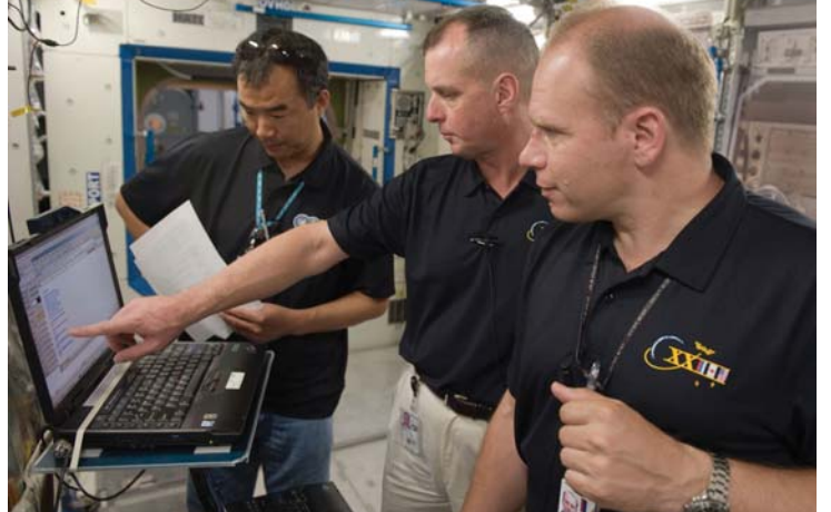
FOR MORE INFORMATION CONTACT: