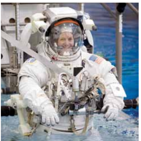
Catherine Coleman is being submerged in the waters of NASA's Neutral Buoyancy Laboratory during training for a spacewalk outside the International Space Station.

Experience: Selected as a European Space Agency astronaut in 1991, he served as a mission specialist on STS-120 in 2006.