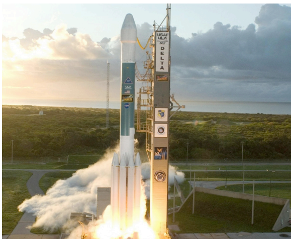
The ELaNa X CubeSats will launch aboard a Delta II rocket as auxiliary payloads on the Soil Moisture Active Passive (SMAP) mission.

The CubeSat Launch Initiative (CSLI) enables the launch of CubeSat projects designed, built and operated by students, teachers and faculty to obtain hands-on flight hardware development experience. CSLI also provides access to space for CubeSats developed by the U.S. government and non-profit organizations giving all these CubeSat developers access to a low-cost pathway to conduct research in the areas of science, exploration, technology development, education or operations. Since its inception in 2010, the initiative has selected more than 100 CubeSats from primarily educational and government institutions around the U.S. These miniature satellites were chosen from a prioritized queue established through a shortlisting process from proposers that responded to public announcements on NASA's CubeSat Launch Initiative. NASA will announce another call for proposals in early- to mid-August 2015.