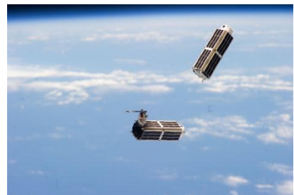
Two of the 28 Planet Labs Dove satellites that make up the Flock 1 constellation are seen launching into orbit earlier this year from the space station.

Orbital-2 mission. They will deploy using the NanoRacks Smallsat Deployment Program to launch from the space station's Japanese Experiment Module (JEM) airlock. Once deployed, these two flocks will work in unison and capture imagery of the entire planet on a more frequent basis. These images can be used to help identify and track natural disasters and responses to them, as well as improve environmental and agricultural monitoring and management.