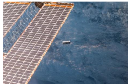
TechEdSat-3p deploys from the Japanese Small Satellite Orbital Deployer aboard the International Space Station.

The satellite-related investigation TechEdSat-4 is part of a larger ongoing study, the Small Payload Quick Return system, which provides a means of returning small payloads in a temperature and pressure controlled environment from the space station. TechEdSat-4 will deploy using the JEM Small Satellite Orbital Deployer. Its primary objectives are to further develop a tension-based drag device, or "Exo-Brake," and demonstrate frequent uplink/downlink control capabilities. Engineers believe exo-brakes eventually will enable small samples return from the station or other orbital platforms to Earth.