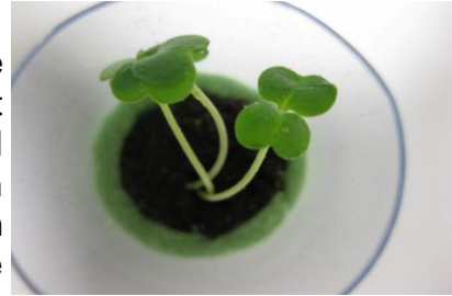
A close-up of the plant incubator in the NanoRacks Girl Scouts of Hawaii Microgreen Plant Growth investigation.

ability to propose and design real experiments to fly on the space station. This investigation consists of 15 independent studies that were selected out of 1,344 student team proposals. These individual studies range from food growth and consumption, to determining the effect of microgravity on oxidation, to even the production of penicillin on the space station.