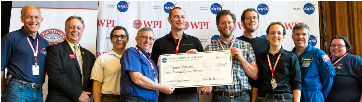
Team Survey accepts a Level One prize during the 2013 Sample Return Robot Centennial Challenge, held at Worcester Polytechnic Institute.