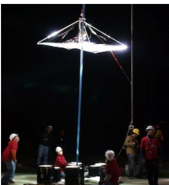
Photo above: The amount of power generated by each solar panel depends on its orientation with respect to the sun and on any shadows on the solar collectors. NASA provided Longeron Challenge contestants with code to calculate the power generated at a specific orientation.

At completion, there were 4,056 registered solvers, 459 competitors, and 2,185 submissions – the most popular NASA Tournament Lab challenge to date. In just under two weeks of challenges, the top 10 solutions verified that current NASA implementations are optimized. In addition, several new models were developed that NASA may consider for future use as additional solar array joints degrade.