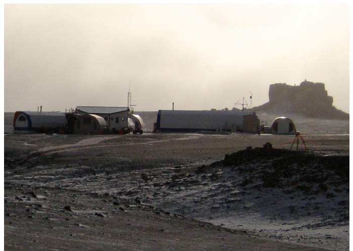
The Haughton Mars Project research station located on Devon Island, Canada.

During the Haughton Mars Project, scientists and engineers from NASA, the Mars Institute, and the SETI Institute perform multiple representative lunar science and exploration surface activities using existing field infrastructure and surface assets. Science and operational concepts are demonstrated, including extravehicular activity traverses, long-term hi-data communication, complex robotic interaction, and on-board rover and suit engineering.