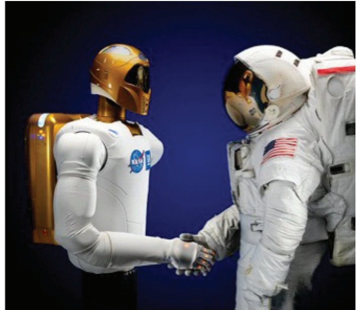
Robonaut 2, now onboard the International Space Station, shakes hands with an astronaut.

One example of space station research examines how humans and robots work together to overcome technical challenges. These human-robotic partnerships will be tested with the addition of Robonaut 2 (R2) at the ISS. The conditions in the space station will provide an ideal test setting for robots to work in close proximity to humans, while also working in a zero gravity environment. The plan is to evolve the system with new software uploads and subsystems, such as legs or mobility aids, to eventually allow R2 to work outside of the space station. This evolution will allow R2 handlers to better understand how the system will work in the vacuum of space, helping them prepare for future space missions.