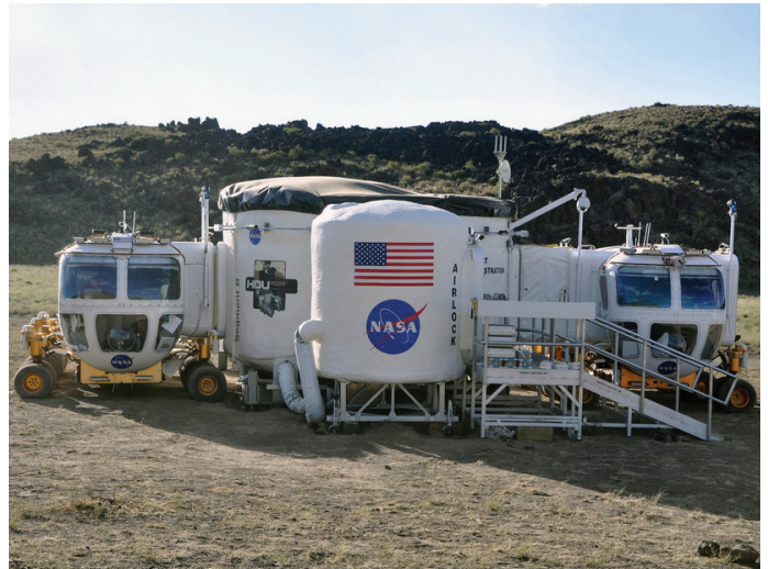
Two rovers are connected to the Habitat Demonstration Unit during field tests in Arizona.

The Arizona desert has a rough, dusty terrain and extreme temperature swings that simulate conditions that may be encountered on other surfaces in space. Additionally, its remote location presents realistic communication scenarios. Some examples of technologies the Desert RATS team has evaluated include high fidelity prototype hardware, space-suit equipment, robots, rovers, habitation modules, exploration vehicles, surface mapping and navigation techniques, and power and communication systems.