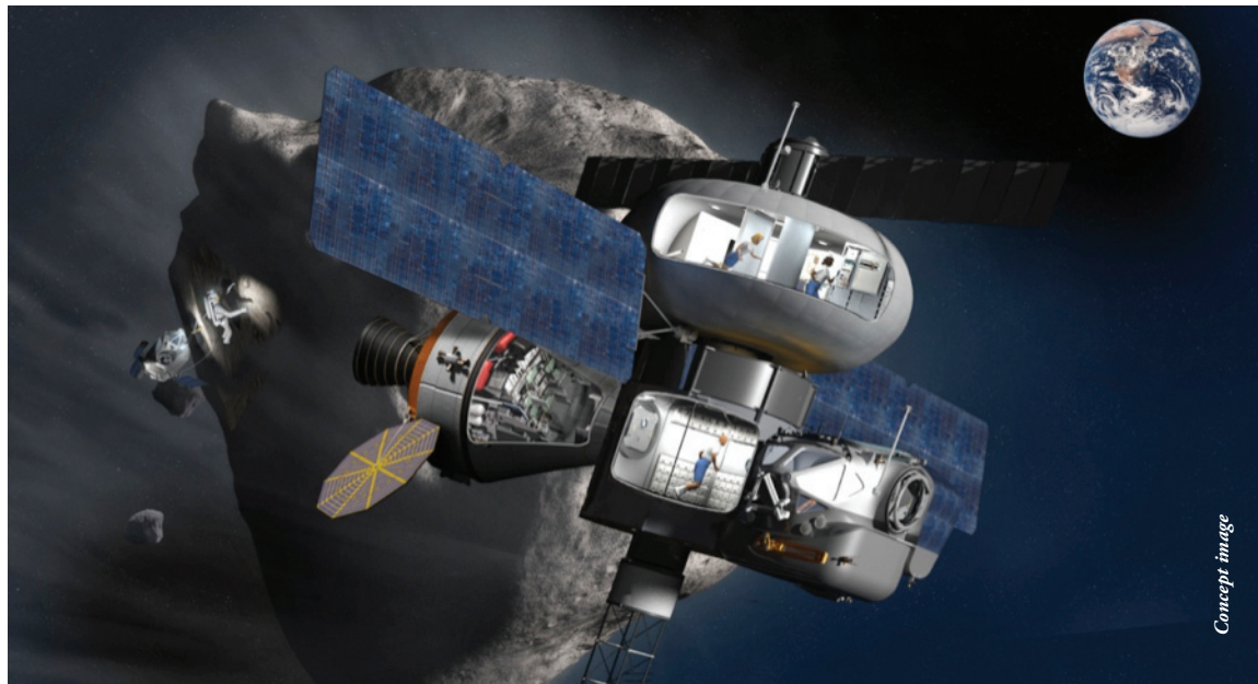
The in-space habitat with crew transportation and space exploration vehicles during a near Earth asteroid mission.

NASA's Apollo program successfully conducted analog missions to develop extravehicular activities, surface transportation and geophysics capabilities. Today, analog missions are conducted to validate architecture concepts, conduct technology demonstrations, and gain a deeper understanding of system-wide technical and operational challenges. These analog missions test robotics, vehicles, habitats, communication systems, in-situ resource utilization and human performance as it relates to these technologies.