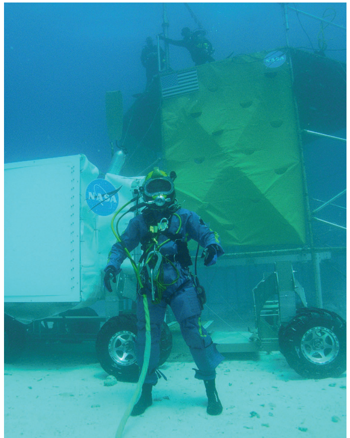
An astronaut stands in front of an exploration vehicle mockup during field tests off the coast of Florida.

Long-duration missions, lasting up to three weeks, provide astronauts the opportunity to simulate living on a spacecraft and execute undersea extravehicular activities. During these activities they are able to test advanced navigation and communication equipment and future exploration vehicles. These tests cultivate an astronaut's understanding of daily mission operations, and create realistic scenarios for crews in close quarters to make real-time decisions.