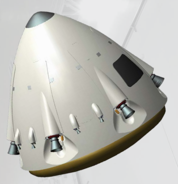
Propulsively stabilized MLAS concept.

From a napkin sketch design drawn by the NASA Administrator at the time, which featured six sidemounted escape motors attached to the service module, the NESC team focused on key issues such as the number and placement of motors, separation dynamics, stability following motor burnout, and CM extraction from the fairing. This concept became the basis for the MLAS flight test vehicle, which would be boosted to abort test conditions to prove MLAS was passively stable, could be reoriented with parachutes, and safely release the CM for crew recovery. Launched from NASA Wallops Flight Facility in July 2009, the MLAS successfully demonstrated all flight test objectives.