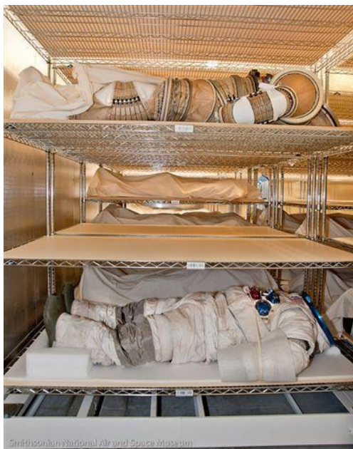
Figure 1. The Stephen F. Udvar-Hazy Center.

This new facility contains the actual flight suits along with the training and developmental suits from the Mercury, Gemini, and Apollo programs. In addition, the suit planned for use on the Air Force Manned Orbiting Laboratory and the series of hard-element suits developed by Litton, AiResearch, Ames Research Center, and JSC are included. Completing the inventory are aviation flight suits.