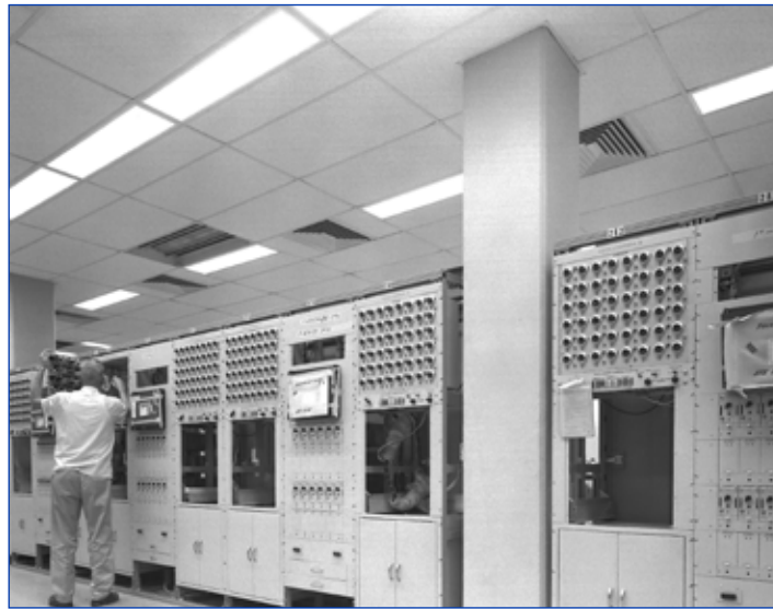
An employee works with Data Acquisition Facility instrumentation in 1965.

A half century ago, the DAF was operated and maintained by about 65 engineers and technicians of the General Electric Company's Mississippi Test Support Department. GE was the prime contractor to NASA for plant and technical support and technical systems at the test facility. Without the DAF, testing would be meaningless.