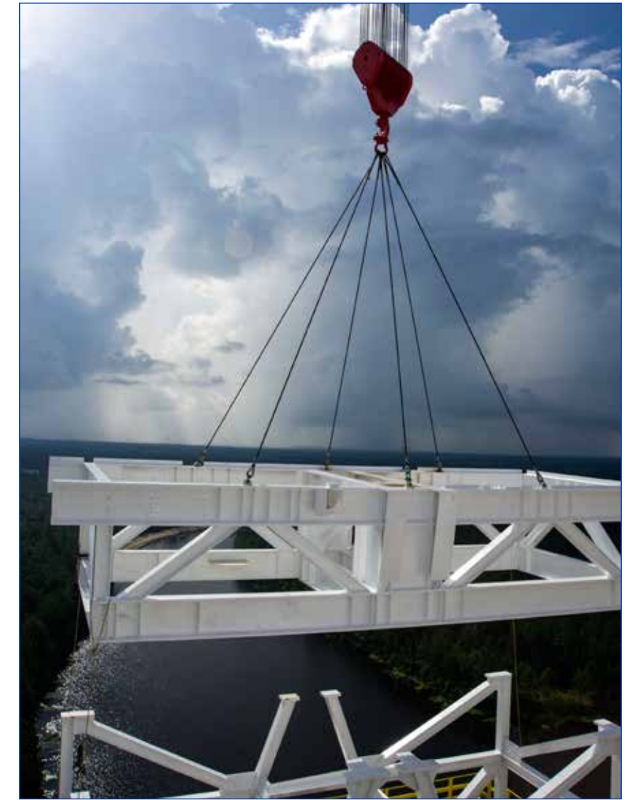
(Top left photo) Middle-school students participate in hands-on activities during an education outreach effort in Tupelo on Oct. 5-6. (Top center photo) NASA's Pegasus barge arrives at Stennis on Aug. 13. Pegasus barge was built in 1999 to transport space shuttle external tanks. It has been modified to carry the Space Launch System core stage between NASA sites in Louisiana, Mississippi, Alabama and Florida. (Top right photo) A structural steel frame is lifted into place on the B-2 Test Stand in preparation for Space Launch System core stage testing. (Bottom left photo) Former Stennis Director Jerry Hlass speaks during an April 8 ceremony naming a site road in honor of his service. (Bottom right photo) Operators at the E-2 Test Stand at Stennis conduct a test of the oxygen preburner component being developed by SpaceX for its Raptor rocket engine, which is being built to power flights to Mars.