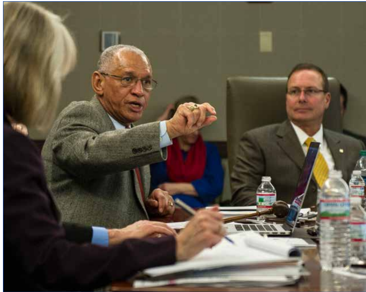
(Top left photo) NASA Administrator Charles Bolden speaks to NASA Advisory Council members during the group's Jan. 14 meeting at Stennis.