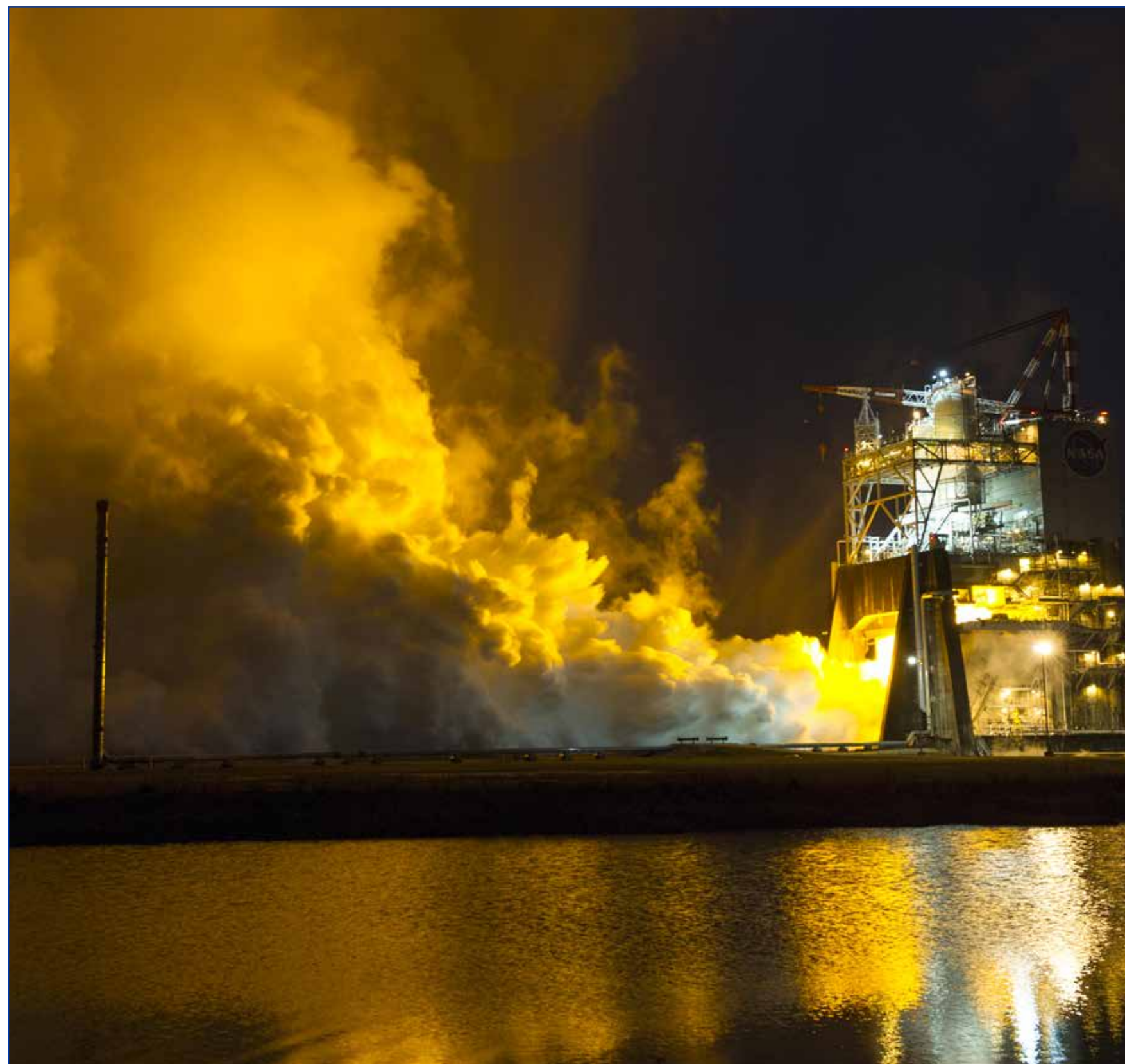
NASA conducts the first of a series of developmental tests on the RS-25 rocket engine on the A-1 Test Stand at Stennis Space Center on January 9, 2015.