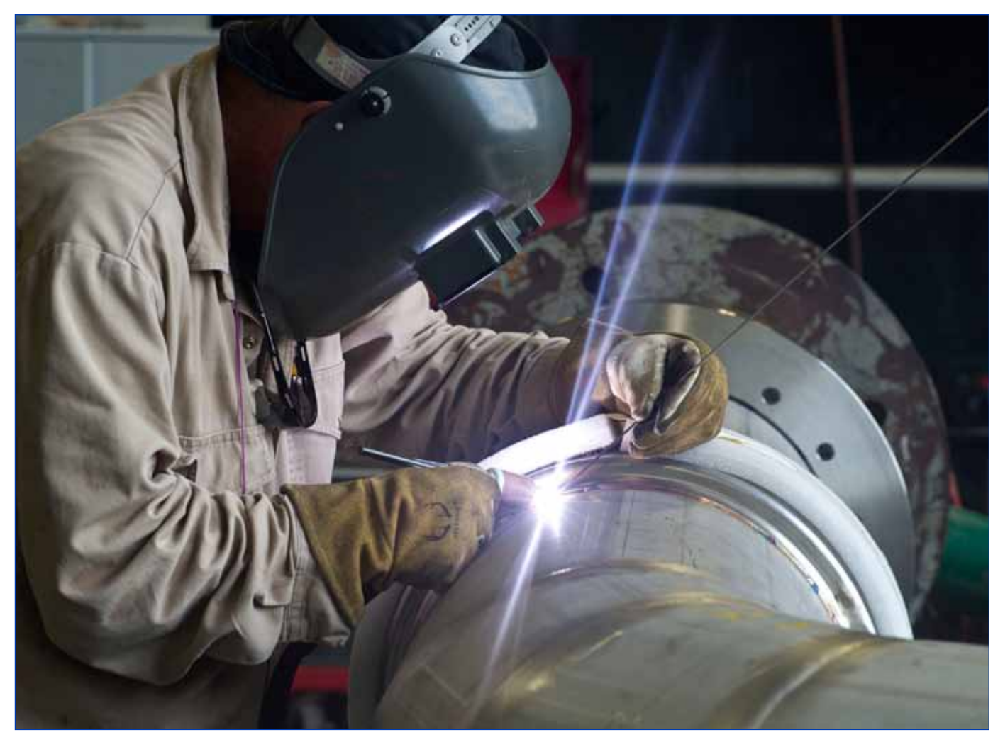
(Top photo) A welder at NASA's Stennis Space Center works on a portion of piping to be installed on the A-1 Test Stand for RS-25 rocket engine testing. NASA is scheduled to begin testing RS-25 engines next spring for use on its new Space Launch System

"Even with the RS-25 engine's flawless performance on all 135 space shuttle missions, a different rocket like SLS has new environmental and thrust conditions and therefore different test consider-