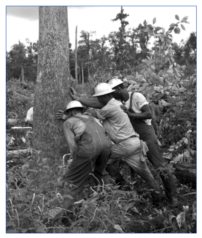
Workers clear land for construction of Stennis Space Center in 1963.

As the NASA team searched for new and diverse partners, the space shuttle main engine test project was assigned to the site in 1971, initiating a rocket engine test