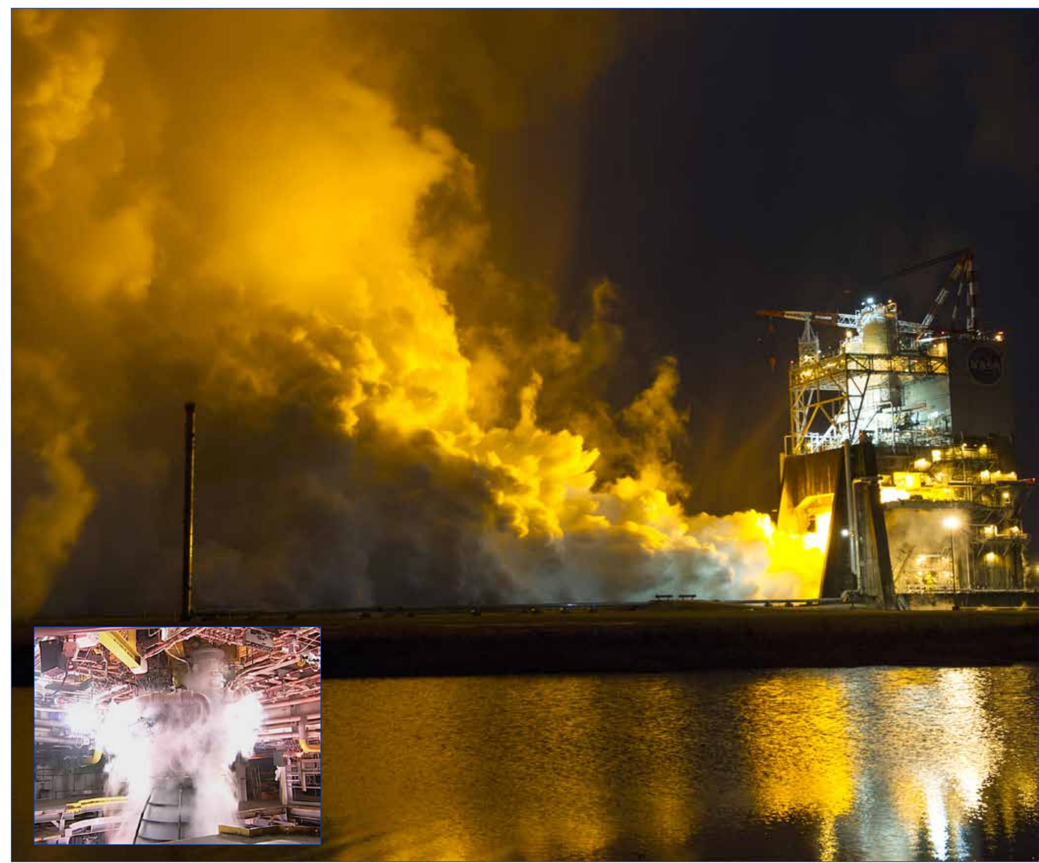
The RS-25 engine that will drive NASA's new rocket, the Space Launch System, to deep space blazes through its first successful test Jan. 9. An inset image shows a closeup view of the engine on that stand.

For a video of test, go to: https://www.youtube.com/watch?v=hG8odscqlfI.