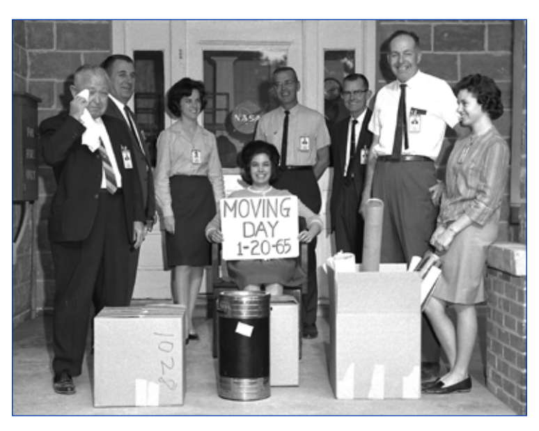
Members of the NASA Technical Services Office, now known as the Center Operations Directorate, advertise their moving date, January 20, 1965, from the Sone House to the newly constructed Building 1100.

– the vehicle storage and checkout building for the S-II stage of the Saturn V rocket and the service building for cryogenic barges (two buildings joined together). The S-II storage and checkout building was designed to receive and store rocket stages, prepare and check them out prior to test firing, perform minor rework and repackage them for shipment to Cape Kennedy in Florida. They included a horizontal storage area, a smaller maintenance area and a 126-foot high vertical checkout bay.