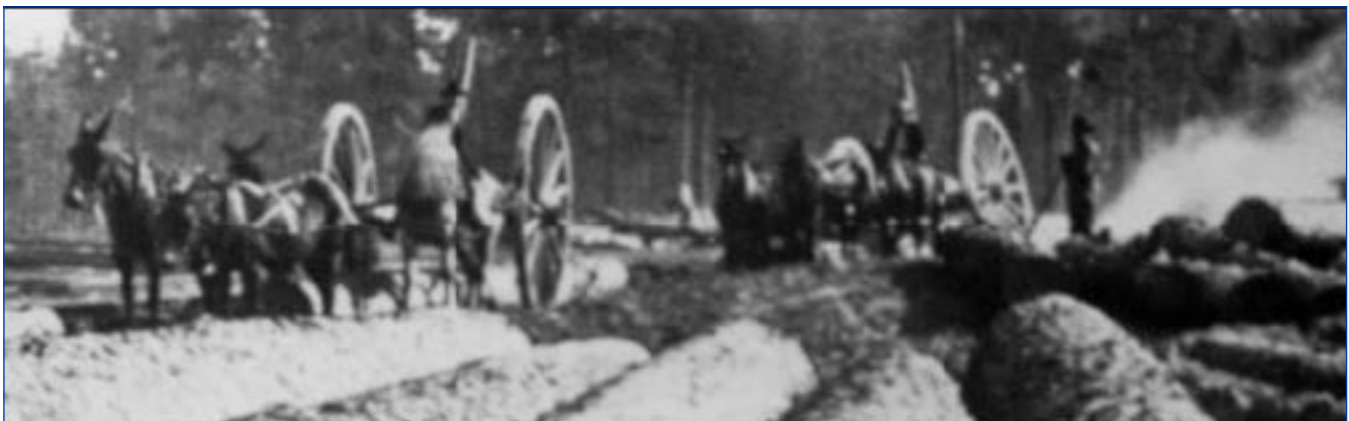
Usan Vaughn invented the famous high-wheeled, wide-tread carrylog (caralog) shown above that made it possible for logging crews to work in wet ground and haul out logs of any size with their sturdy ox teams.

To access the Callaway article, visit: http://tiny.cc/og12ax .