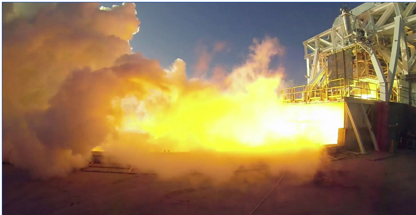
A team of NASA, Orbital Sciences Corporation, Aerojet Rocketdyne and Lockheed Martin engineers conduct a hotfire test of Aerojet Rocketdyne AJ26 engine E-15 on the E-1 Test Stand at NASA's Stennis Space Center on Jan. 17.

O n Jan. 17, Aerojet Rocketdyne AJ26 engine designated E-15 roared to life at NASA's Stennis Space Center as a team of engineers conducted a hot-fire test on the E-1 Test Stand. Initial indications are that the rocket engine performed as expected.