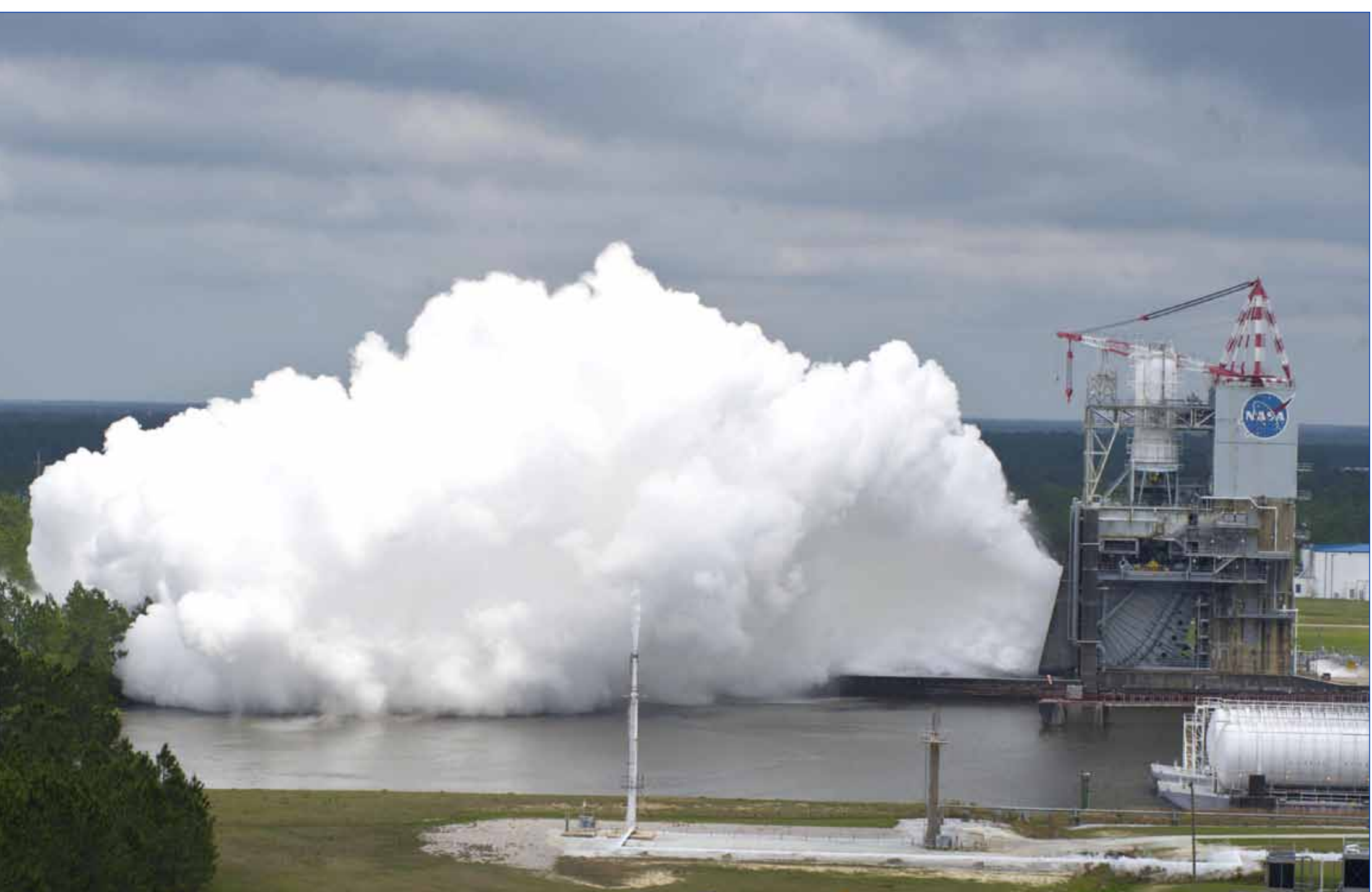
NASA conducts the final test of J-2X engine No. 10002 on the A-2 Test Stand at Stennis Space Center on April 17. The engine now will undergo gimbal testing on the A-1 Test Stand while the A-2 facility prepares for arrival of J-2X engine No. 10003.

The March 7 test, which set the short-lived duration record, was remarkable for another reason in that it marked the first time a 3-D printed part was hot-fire tested on a NASA engine system.