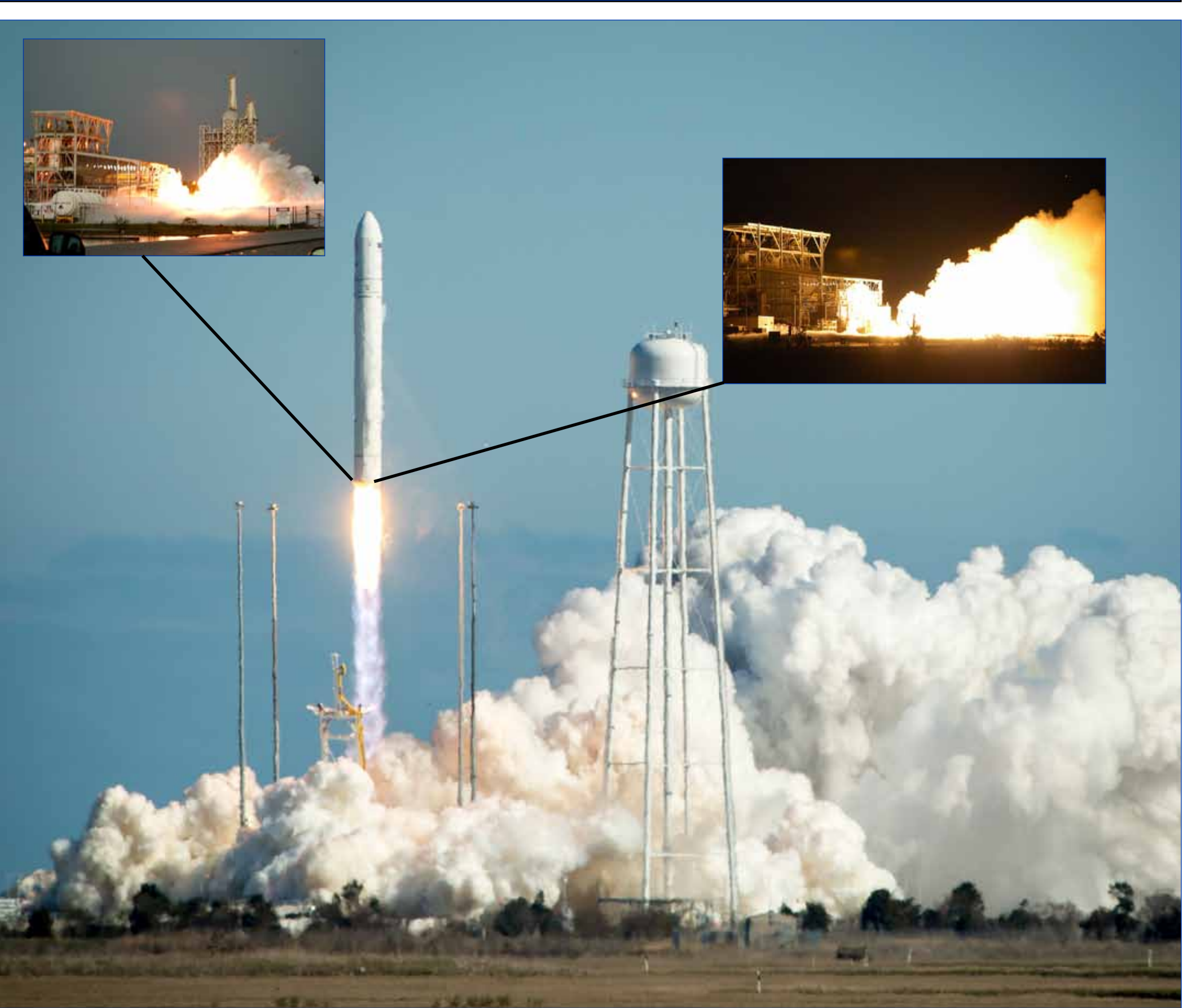
The Antares rocket launched by Orbital Sciences Corporation on April 21 was powered by a pair of Aerojet AJ26 engines tested for flightworthiness at Stennis Space Center. Engine No. 6 was tested on the E-1 Test Stand at Stennis