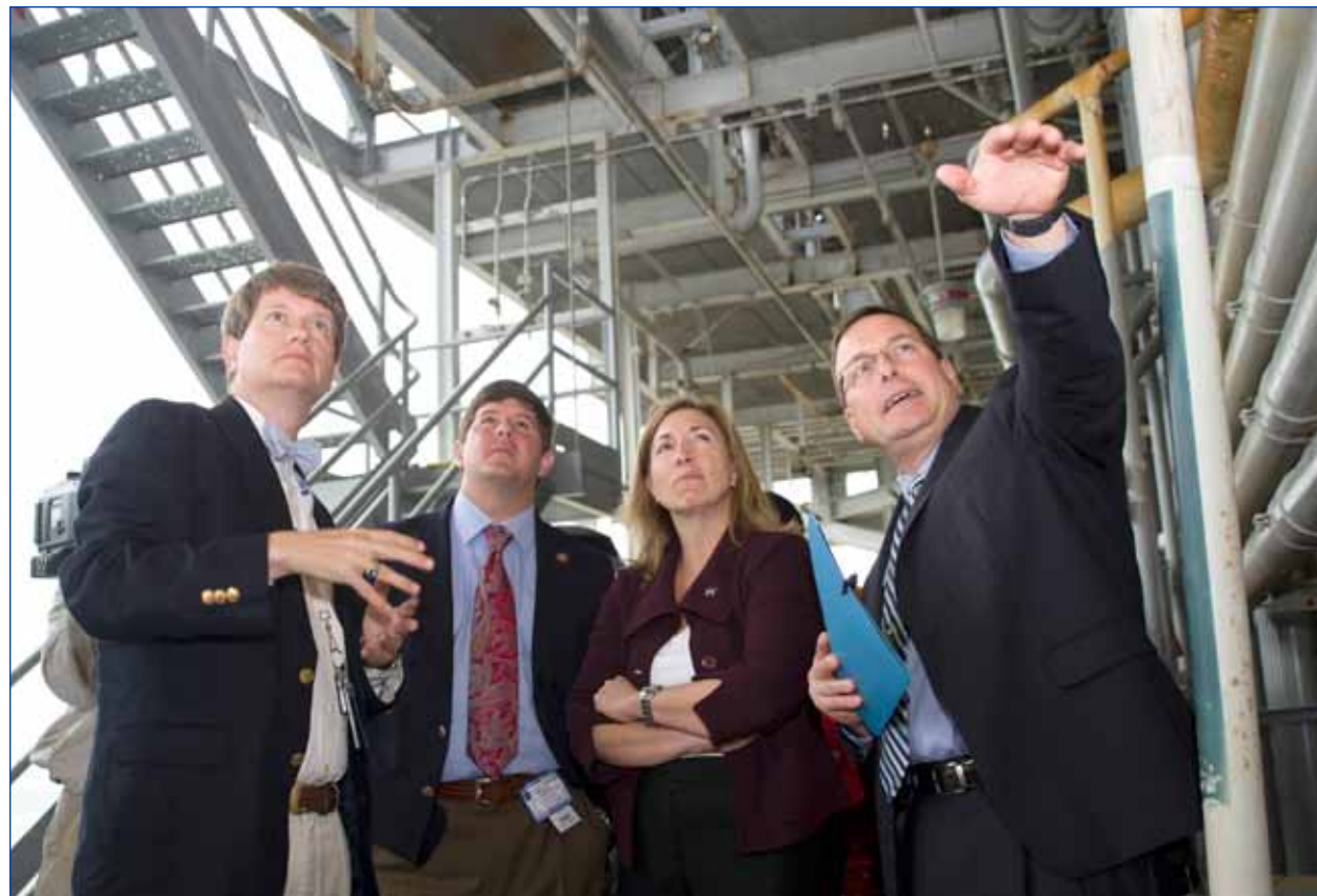
(Right photo) The B-1/B-2 Test Stand is a dual-position, vertical, static-firing structure built at Stennis Space Center in the 1960s. First stages of the Apollo Saturn V rocket were tested on the stand from 1967 to 1970. Space shuttle main propulsion test articles also were tested on the stand. Stennis now leases the B-1 test position to Pratt & Whitney Rocketdyne for testing of RS-68 engines