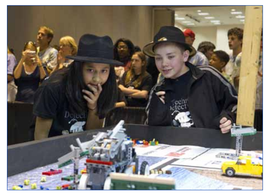
Two students watch closely as their robot competes in the 2011 FLL Mississippi Championship event.

The 2012 FLL season is expected to involve more than 20,000 teams and 200,000 students in at least 50 countries. For information about FLL, visit: www.firstlegoleague.org. For information about the Robotics Alliance of Missisippi, visit: www.ramrobots.org.