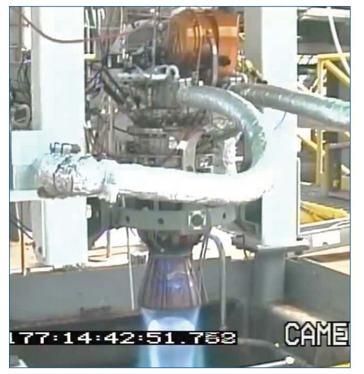
A frame grab from a mounted video camera on the E-3 Test Stand at Stennis Space Center documents testing of the new Project Morpheus engine.

Morpheus is one of 20 small projects comprising NASA's Advanced Exploration Systems Program. AES projects pioneer new approaches for rapidly developing prototype systems, demonstrating key capabilities and validating operational concepts for future human missions beyond Earth orbit.