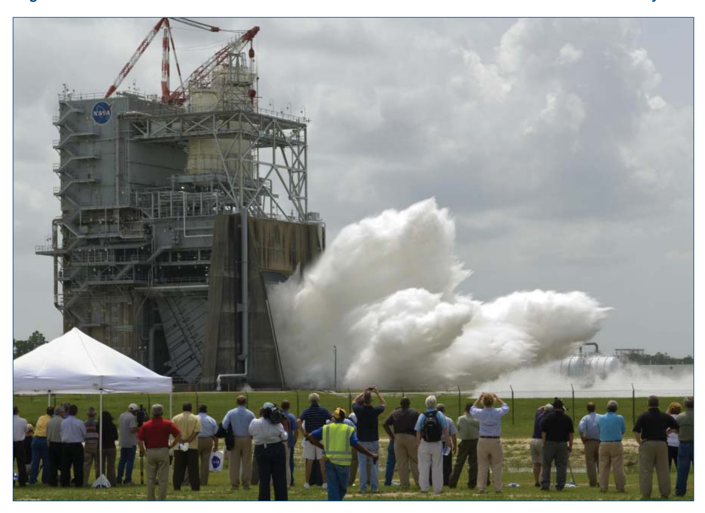
Steam billows from the A-2 Test Stand at Stennis Space Center during a July 29, 2009, space shuttle main engine test. The test was the last for the main engines that powered 135 Space Shuttle Program missions from 1981 to 2011.