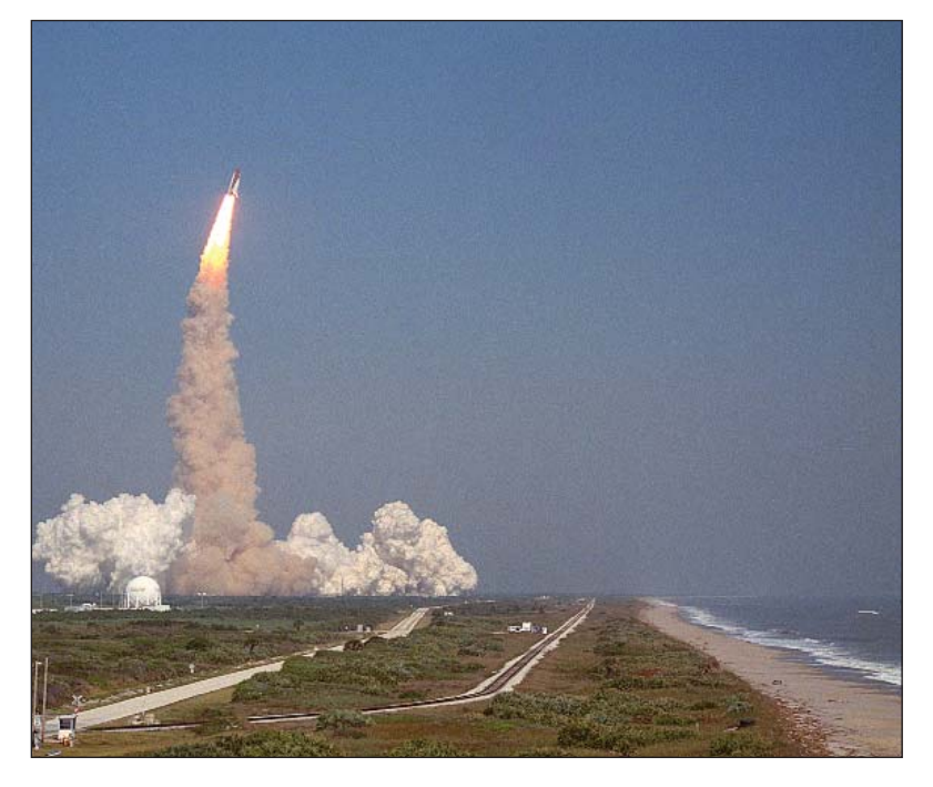
Space shuttle Discovery lifts off from Kennedy Space Center in Florida, on March 13, 1988, to begin its STS-29 mission. The shuttle launch was delayed as NASA engineers replaced high-pressure oxidizer pumps on the spacecraft's main engines. All three of the replacement pumps were tested for flightworthiness at Stennis Space Center prior to launch.

Following flight readiness review, shuttle Discovery departed on its mission, which lasted just 22 minutes shy of five days. During the mission, the shuttle crew deployed its primary payload, Tracking and Data Relay Satellite-4, into orbit. Discovery also carried out several experiments and filmed Earth using a hand-held IMAX camera. The experiments included two submitted through the Shuttle Student Involvement Program to study the effects of