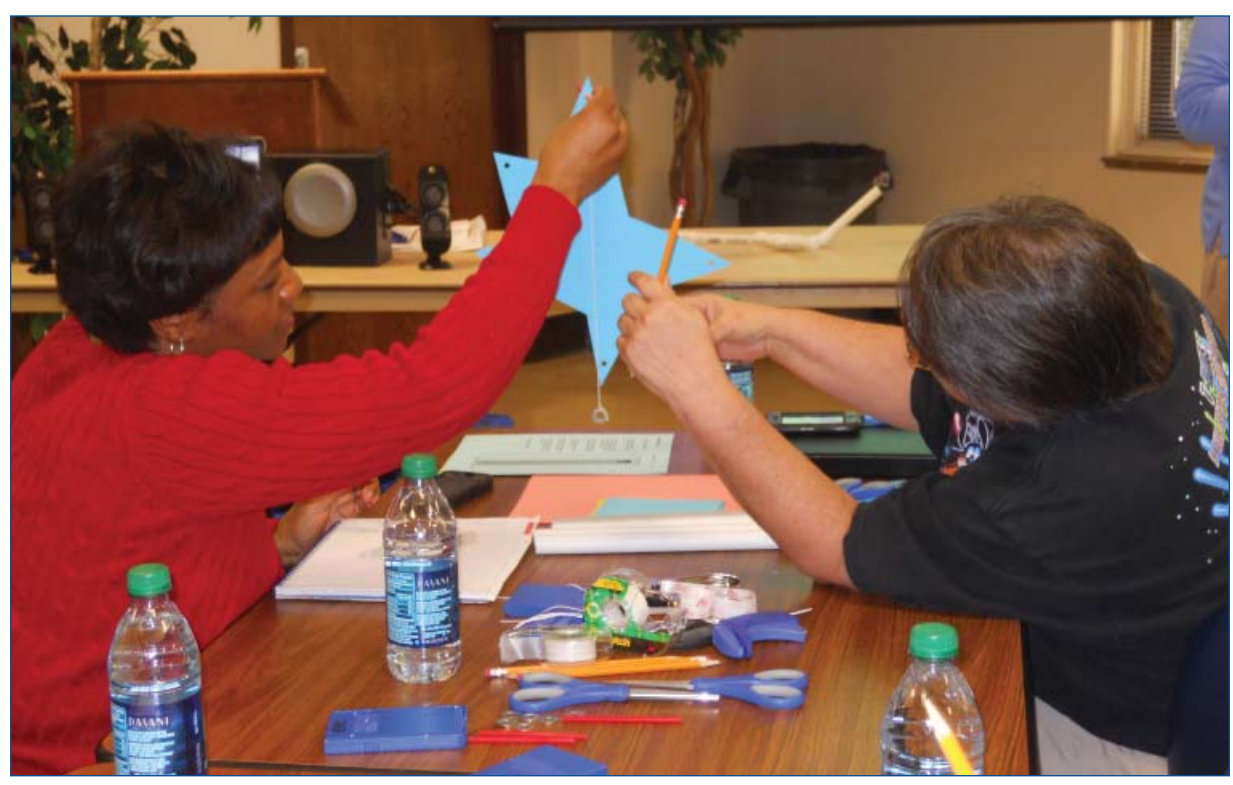
A pair of Louisiana teachers work together during one of two professional development workshops conducted by the Stennis Education Office on Feb. 10-11. About 90 teachers attended the workshops conducted in Hammond and Baton Rouge.

For more information about the SeaPerch Program, visit online at www.seaperch.org.