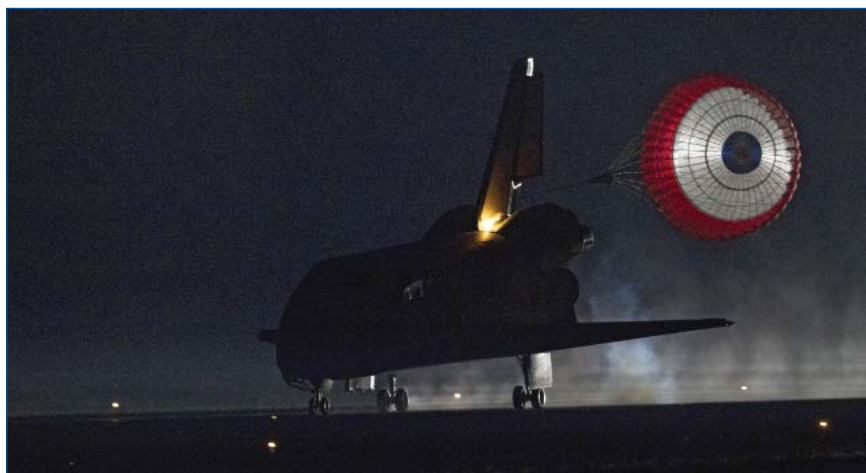
Space shuttle Endeavour touches down at Kennedy Space Center early on the morning of June 1, completing its 25th – and final – flight into space. It now joins shuttle Discovery in retirement.