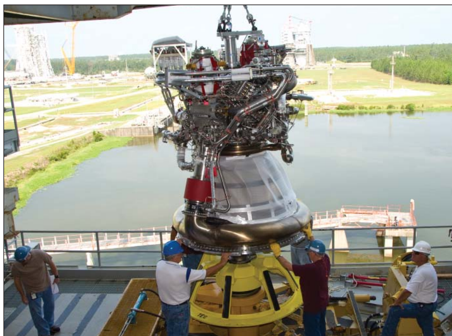
A J-2X rocket engine is lifted onto the A-2 Test Stand at Stennis Space Center. Testing of the next-generation engine is scheduled to begin later this month.