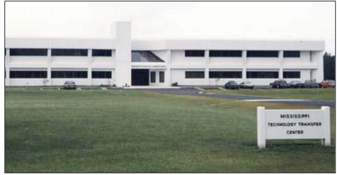
The Mississippi Technology Transfer Center at Stennis Space Center

Orbie can often be seen at various Stennis functions and events. Stay connected with Orbie on Facebook (Orbie the Astronaut page) and Twitter (@OrbieAstronaut).