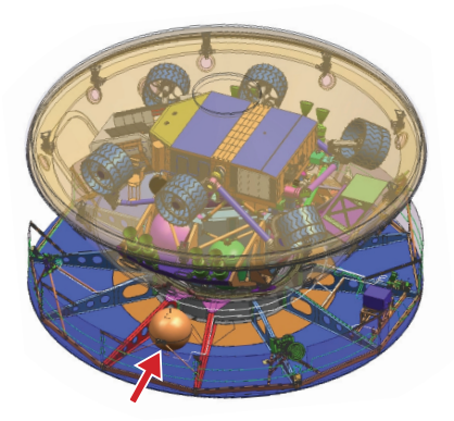
MSL Cruise Stage Propellant Tank

For information contact the NESC at www.nesc.nasa.gov