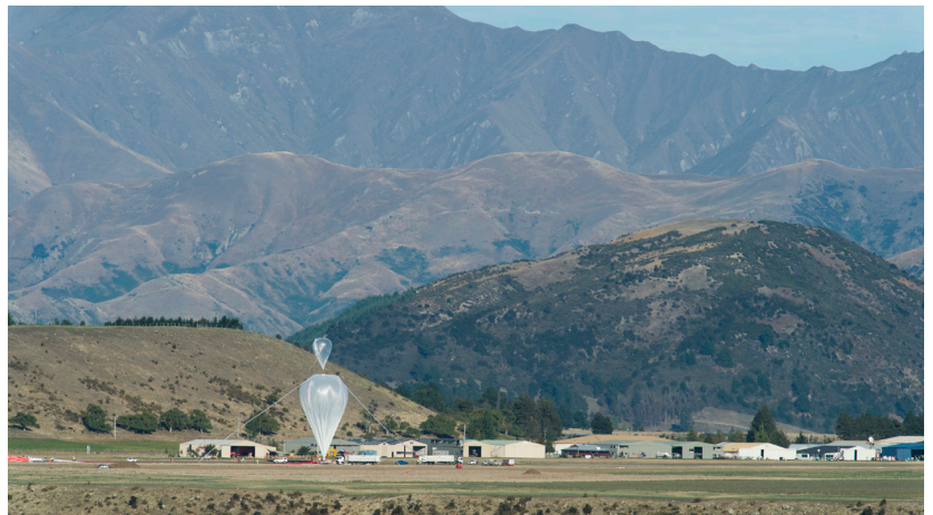
A balloon is ready to be launched from New Zealand.