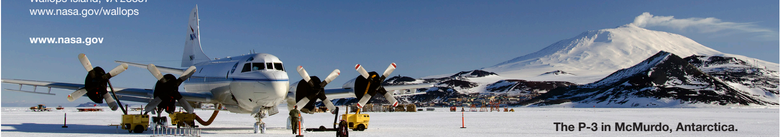
The P-3 in McMurdo, Antarctica.