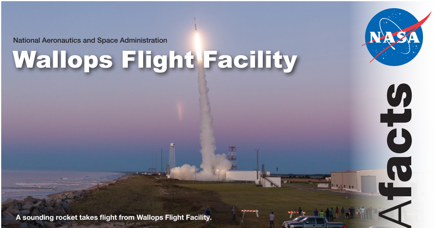
A sounding rocket takes flight from Wallops Flight Facility.