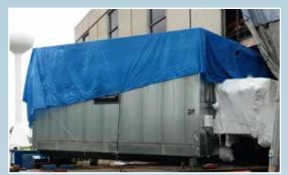
Boiler 24-3A being moved into Building 24

Building 24 is seeing new changes that will help reduce its environmental impact. In September 2016, Boiler 24-4A was replaced with a state-of-the-art energy-efficient burner assembly that will substantially reduce combustion byproducts. Unlike the current system, which is an antiquated flue gas recirculation system, this replacement will decrease carbon monoxide and nitrogen oxides, both of which are precursors to smog formation.