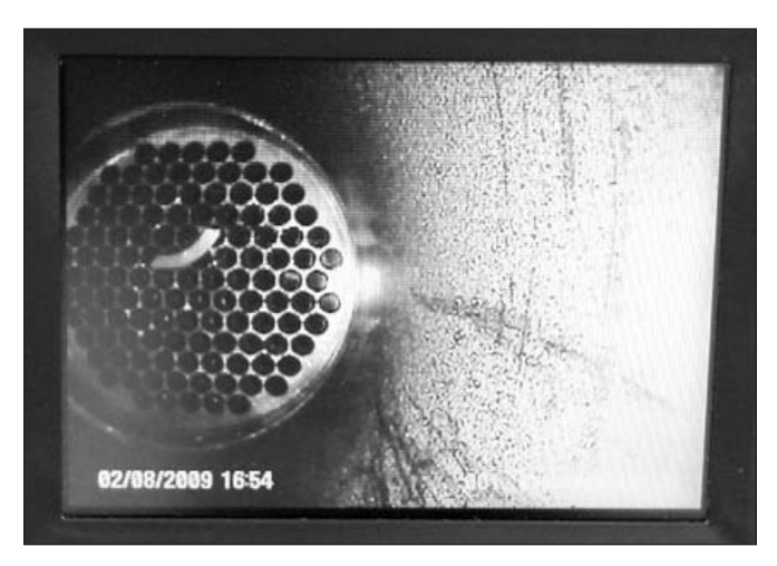
An in-system camera shows a shuttle flow control valve particle resting on the launch screen before being test fired by Stennis Space Center engineers.

The velocity of the test-fired particles were measured at three points and fed into models generated at other NASA centers. Stennis engineers also gathered informa-