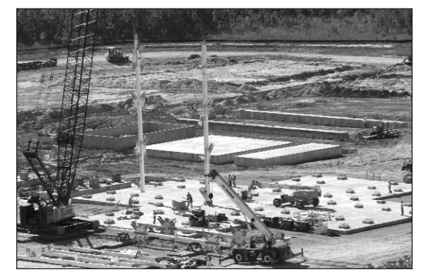
Oct. 29, 2008 - Structural steel work begins.

Stennis Space Center engineers celebrated a key milestone in construction of the A-3 Test Stand on April 9 - completion of structural steel work. Workers with Lafayette (La.) Steel Erector Inc. placed the last structural steel beam atop the stand during a noon ceremony attended by more than 100 workers and guests. Observers applauded and cheered as the beam - which featured signatures of those involved in the project and was topped with an American flag, a NASA flag and a potted pine sapling - was bolted into place. The event marked final assembly of 4 million pounds and 16 stages of fabricated steel on the test stand foundation. The A-3 structure is the first test stand to be built at Stennis since the 1960s, when the facility was opened. Once complete, it will be used to test the J-2X engine being built to help power the Ares I and Ares V rockets that will take humans back to the moon and possibly beyond as part of NASA's Constellation Program. The A-3 Test Stand will allow engineers to test the J-2X engine at simulated altitudes of up to 100,000 feet.