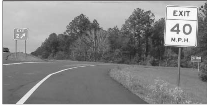
A traffic sign at Interstate 10 Exit 2 clearly displays the legal speed limit for vehicles using the ramp to access Mississippi Route 607.

"Drive the speed limit first of all," said David Delsanto, Stennis security officer. "The speed limit on the ramp is 40 miles per hour. Many drivers are not respecting that fact, and that can create an unsafe situation. Also, drive defensively. Be aware of your surroundings."