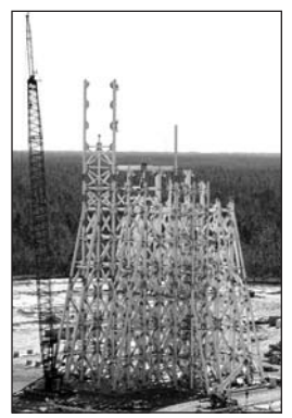
Jan. 23, 2009 - Going up