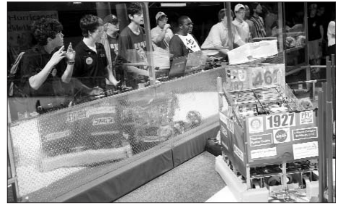
Students (left) from St. Patrick Catholic High School in Biloxi, Miss., maneuver their robot during the 2009 Bayou Regional competition.

Meanwhile, at the Lone Star Regional in Houston on March 26-28, Picayune and Pearl River Central high