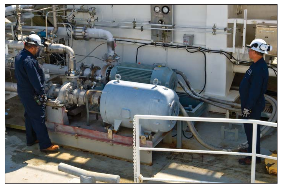
Stennis employees inspect the new liquid oxygen pump (center rear) installed on a propellant barge at the rocket engine test facility. In the foreground is one of the original LOX pumps installed almost 50 years ago. The new variable-speed pump is smaller, more efficient, and easier to maintain and repair.

"This project is progressing extremely well and looks to be a real