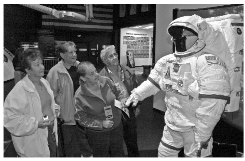
Some of the first visitors to StenniSphere since Hurricane Katrina view a "Photo-op Astronaut" display at the visitor center.

Two new exhibits have been added to the lobby of StenniSphere: One honors astronauts from Mississippi and Louisiana, and the other illustrates NASA technology used to examine the rich history of the towns that once stood on the test site.