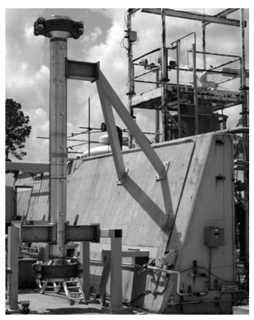
The Instrumentation Test Apparatus simulates conditions in high-pressure tanks for testing probes, sensors and other instrumentation.

Development of the ITA is the result of a multifaceted collaboration over a two-year period. Conceived in discussions between a propulsion test engineer and a technology applications engineer at Stennis Space Center, the initial development of the ITA was encouraged and funded by the Technology Development and Transfer