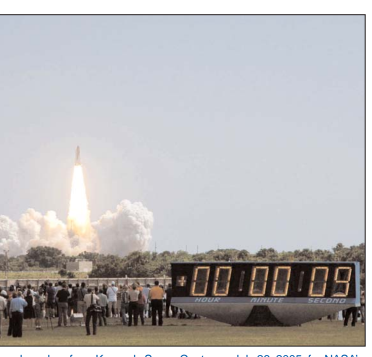
rery launches from Kennedy Space Center on July 26, 2005, for NASA's n, STS-114. The engines that powered the flight were tested at Stennis.