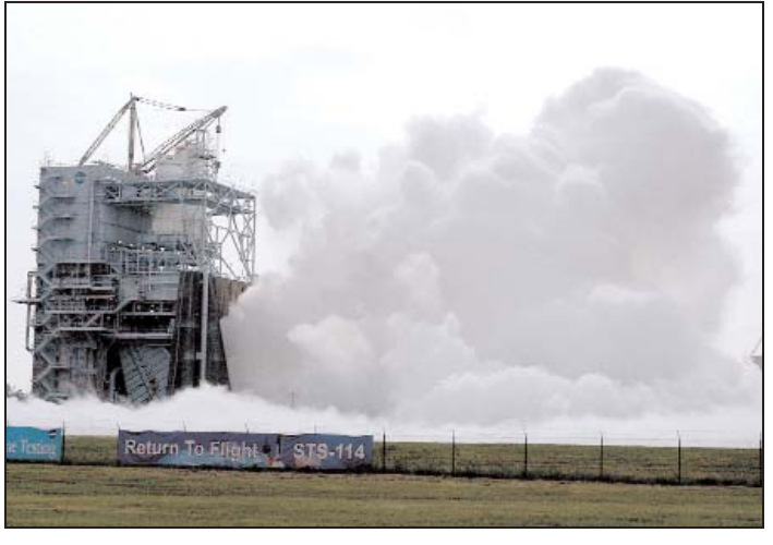
The year 2005 marked the 30th anniversary of testing the space shuttle main engines at NASA's Stennis Space Center, which culminated with this engine test Aug. 11.

As 2006 unfolds, NASA and Stennis prepare to observe two milestones in the history of space flight. April will mark the 40th anniversary of the first rocket engine test and the 25th anniversary of the first space shuttle flight. On April 23, 1966, Stennis conducted the first test of the huge first and second stages of the