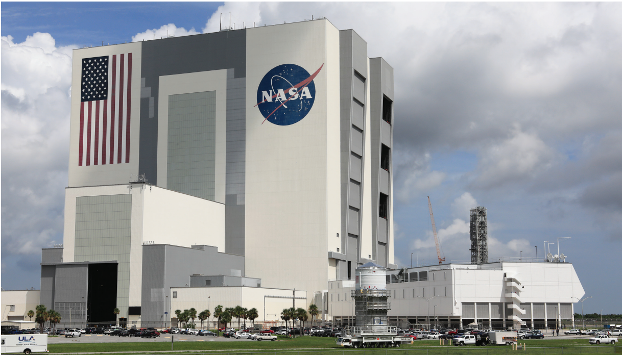
NASA's Vehicle Assembly Building at Kennedy Space Center in Florida was used to assemble and house American-crewed launch vehicles from 1968 to 2011. At 3,684,883 cubic meters, it is one of the largest buildings in the world by volume.